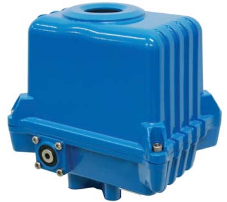
SA05X , 09X